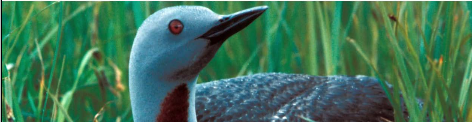
Figure 2. The National Node of the Avian Knowledge Network ( https://data.pointblue.org/partners/natnode/ ).

Home Manage and Explore Data Resources Help