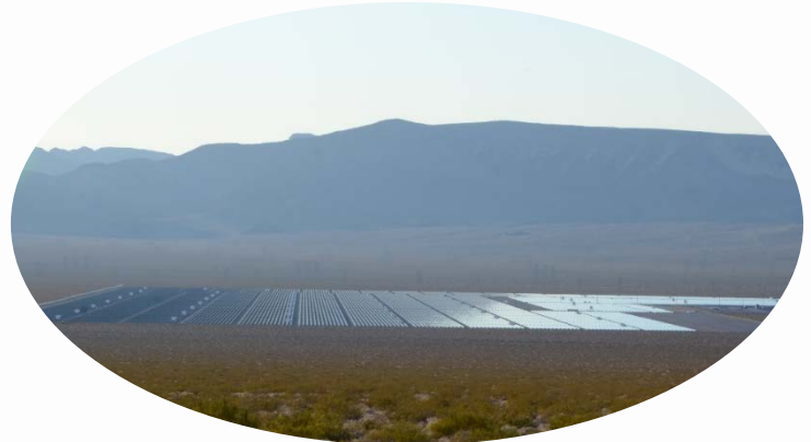
Utility-scale power tower solar facility (left) and photovoltaic solar facility (right).

There are four main data components of the AKN that can facilitate the evaluation of and access to various types of avian data ( Figure 1 ):